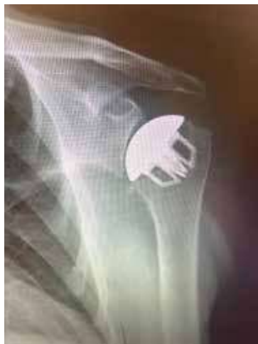
Shoulder Hemiarthroplasty Total Shoulder Arthroplasty

Reverse Total Shoulder Arthroplasty- in this procedure, the ball and socket are “reversed” compared to a standard total shoulder arthroplasty. The metal ball is fixed to the glenoid and the plastic cup is fixed to the top of the humerus.