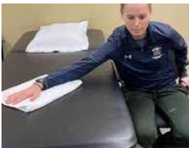
TABLE SLIDE SCAPTION

2 sets, 10 repetitions, hold 10 seconds. 1-2x/day