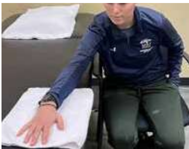
TABLE SLIDE FLEXION

Sit in a chair and place your affected arm on the table. Slowly slide arm forward until a stretch is felt. Hold, then return to starting position and repeat. It is ok to gently lean forward with your body.