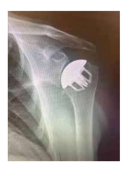
Shoulder Hemiarthroplasty Total Shoulder Arthroplasty

Reverse Total Shoulder Arthroplasty - in this procedure, the ball and socket are "reversed" compared to a standard total shoulder arthroplasty. The metal ball is fixed to the glenoid and the plastic cup is fixed to the top of the humerus.